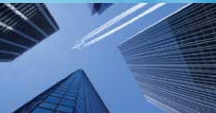
3CX Bridges Setup inter- office calls as FREE internal calls