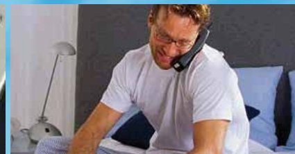
Tele-work Employees work remotely while staying connected to the company's IP PBX

“ Configurability of 3CX is outstanding – we can easily make changes to the PBX ourselves, something that was unthinkable on a traditional PBX. ”