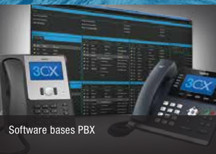
Software based PBX