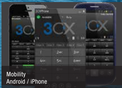
Mobility Android / iPhone