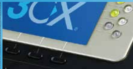
Advanced Features No extra cost for voice mail, auto attendant and Queues.